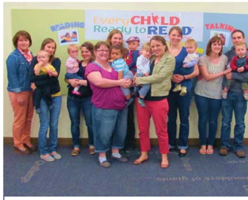
C-SPL Toddler Story Time 2015

Children from birth to age five will have programs and services designed to increase readiness to read, write, and listen when they start school.