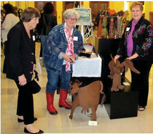
C-SPL Art @ Your Library® Program 2015

Remove hindrances associated with parking at the Library to promote ease of access.