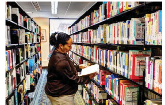
C-SPL patron browsing the non-fiction collection 2015

Members of the Carnegie-Stout Public Library will have access to a wealth of current and popular materials when they want them.